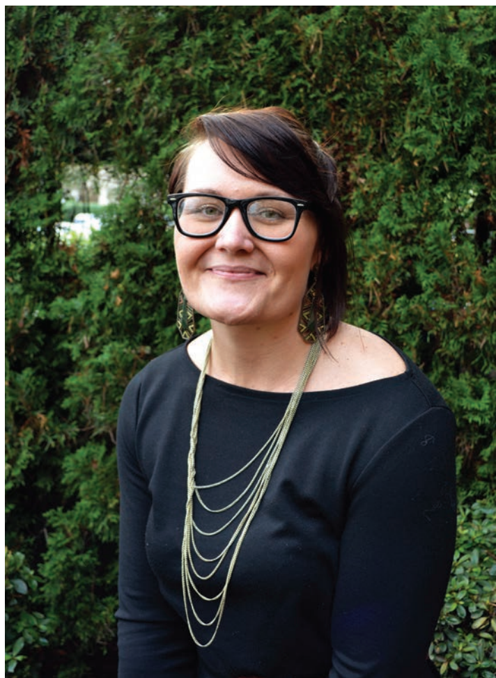
Crys said bouncing between three schools and four homes disrupted her education.

For young people like O'Grady, entering state care means being at risk of dropping out of high school, and battling an even steeper climb to get a college degree. The statistics are grim: Just under 60 percent of young people who age out of foster care graduate from high school by age 19, compared to almost 90 percent of all young people,